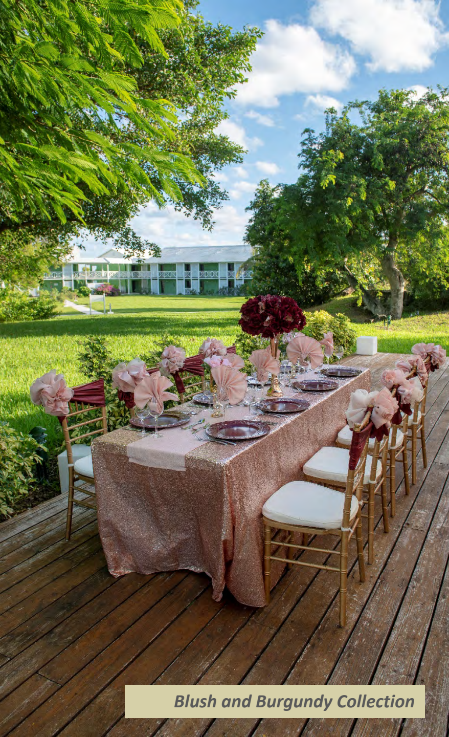
Blush and Burgundy Collection